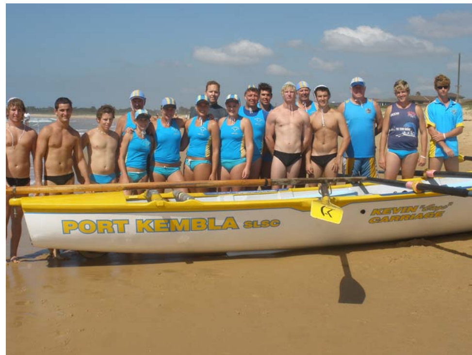
Boat crew members who competed at the State, Branch & South Coast Boat Series

A gentleman and stalwart of Port Kembla Surf Life Saving Club.